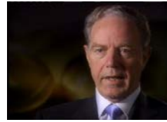
Uwe Reinhardt, PhD James Madison Professor of Political Economy and Professor of Economics, Princeton University